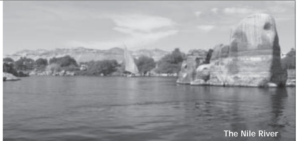
The Nile River

It is perhaps the closed shop perspective that led to the formation of the Nile Basin Discourse (NBD), a Civil Society initiative aimed at monitoring progress on