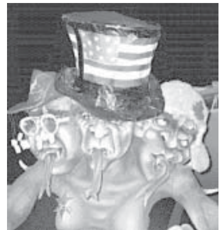
The Bali Monster